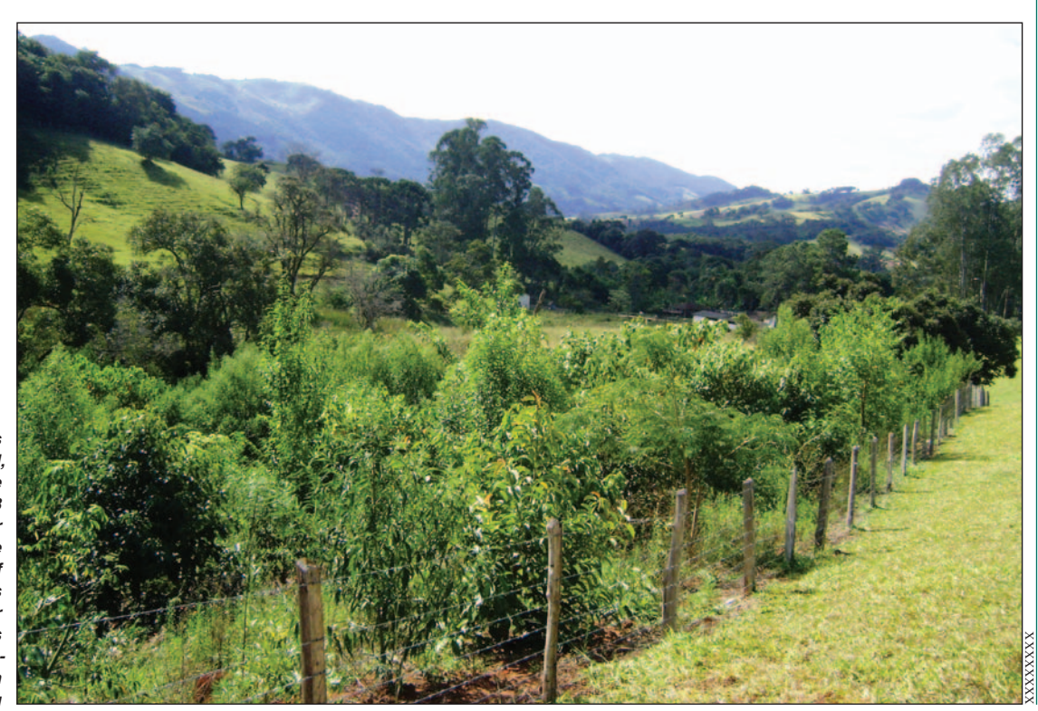
In Extrema, Minas Gerais, Brazil, landowners are receiving US$118 per ha per year to allow the restoration of riparian areas important for water production, such as this 1-year-old highdiversity restoration planting

PES schemes can generate synergies (Strassburg et al. , 2010): those that target one ecosystem service can usually help in obtaining payments for others (Strassburg et al. , 2012). Bundling several PES schemes can increase the magnitude and diversity of the income generated by forest restoration.