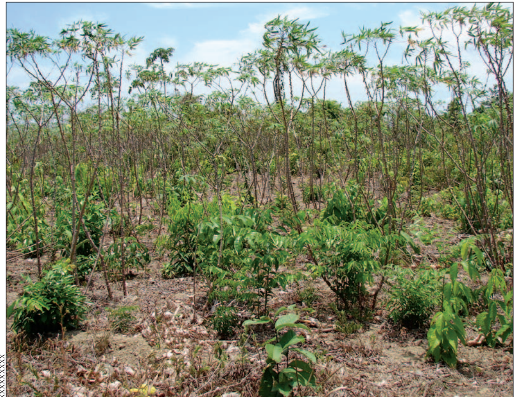
The cultivation of cassava among naturally regenerating and planted trees in a restoration project in the Atlantic forest. northeastern Brazil. In such an arrangement, farmers control weeds to obtain a higher crop yield and indirectly favour the development of native tree species by reducing competition. Proiect revenue is increased by the production of crops and the reduction of maintenance costs

In Brazil, PES is also used by watershed committees, which are collectives responsible for the management of water resources within specific watersheds. Established by Brazilian law, watershed committees charge for the use of water within a watershed and return part of this fee through PES to landowners who implement forest restoration projects (Veiga and Gavaldão, 2011). In Extrema, Minas Gerais, in southeastern Brazil, for example, the municipal government pays approximately US$118 per ha per year to more than 100 landowners who have substituted forest restoration plantings for