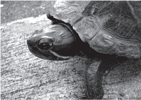
Figure 2. A captured Trachemys scripta elegans .