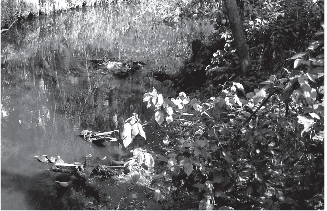
Figure 1. The polluted Piracicamirim stream. Turtles basking in bottom left hand corner.

et al., 2004; Ficetola et al., 2002; Luiselli et al., 1997). However, it is likely that the local tropical climate may not prevent the survival of hatchlings (Caiagro, 2008).